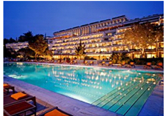
Astir Palace Hotel Resort Athens, Greece

For decades myriads of leaders from many international organizations have been meeting to discuss a world government with a central head. The latest occurred with the Bilderbergers' annual convention, which met May 17, 2009, at the Astir Palace Hotel Resort in Athens, Greece (the group began in 1954). Those meetings were so secret that they had hundreds of police, navy commandos, Coast Guard speed boats and F-16 fighter planes to guard the area.[3]