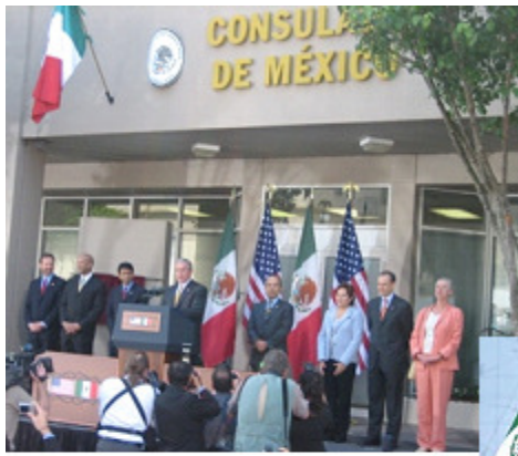
North American Leaders' Summit – Mexico - 2005