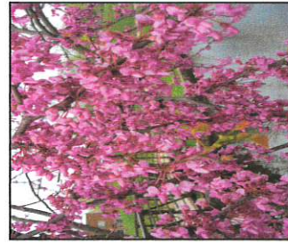
Buchanan, MI Redbud City