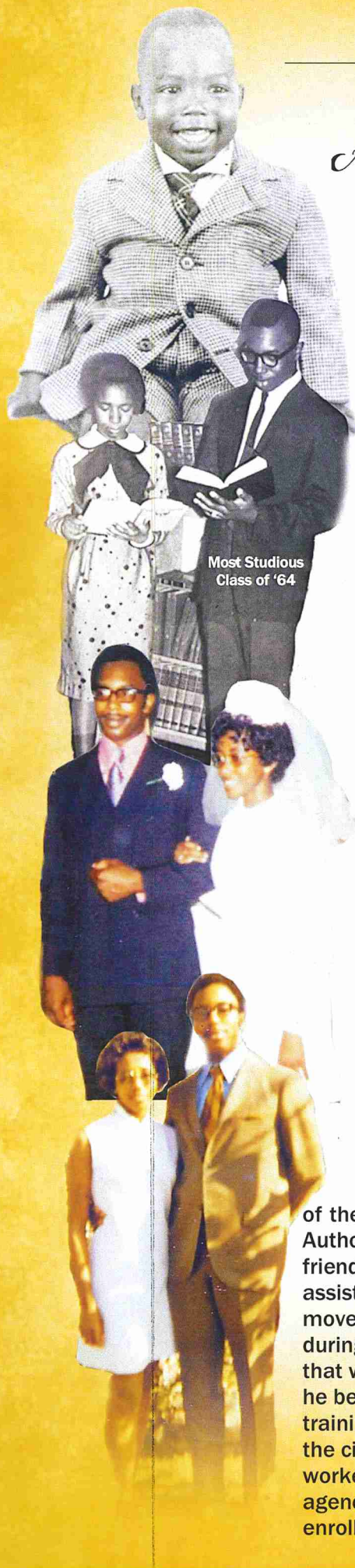
Most Studious Class of '64