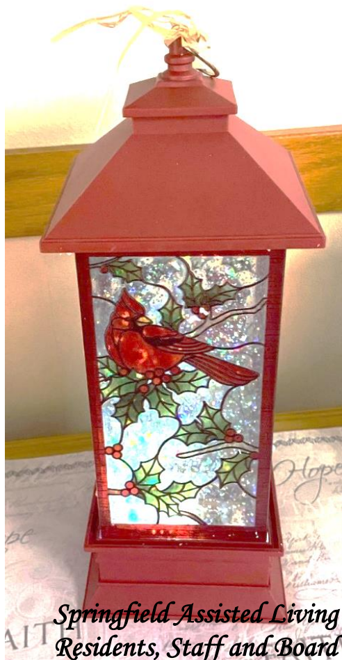
Springfield Assisted Living Residents, Staff and Board