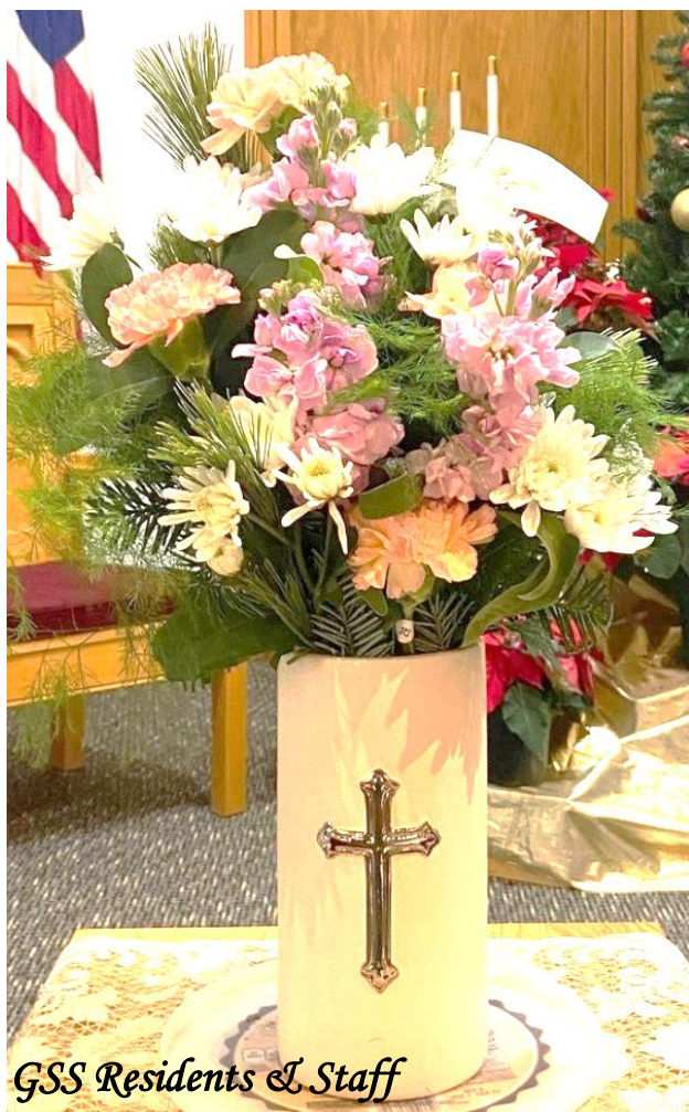
GSS Residents & Staff