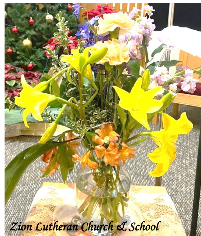
Zion Lutheran Church & School