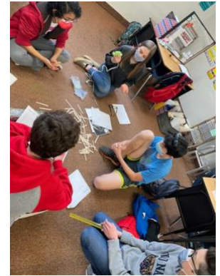
Bridge construction and final result.