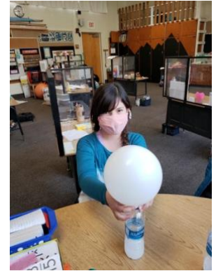
2-4 Grades observing gas chemical reaction