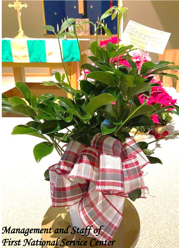
Management and Staff of First National Service Center