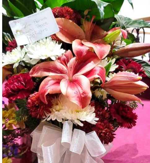
Bon Homme Peace Officers