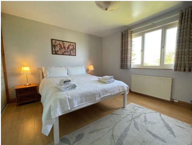
Upstairs master bedroom with king-sized bed