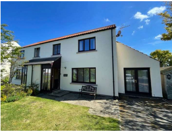
Front view of High Rigg

Bed linen and towels are provided; please bring your own soap and toiletries.