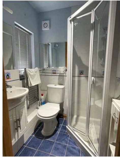
Downstairs shower room