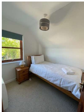
Smaller single bedroom