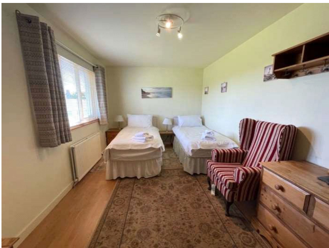
Upstairs twin bedroom