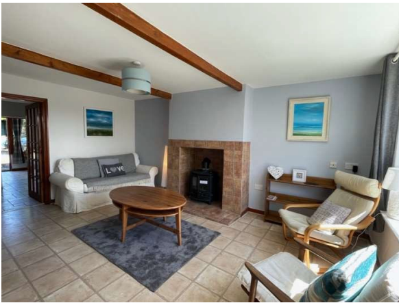
Lounge and dining room