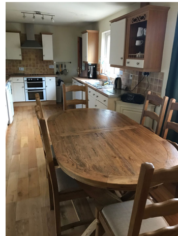
Dining area in kitchen