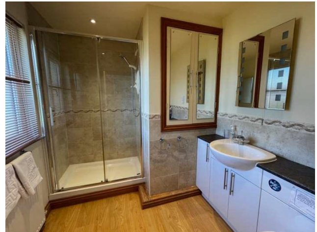
Master ensuite shower room