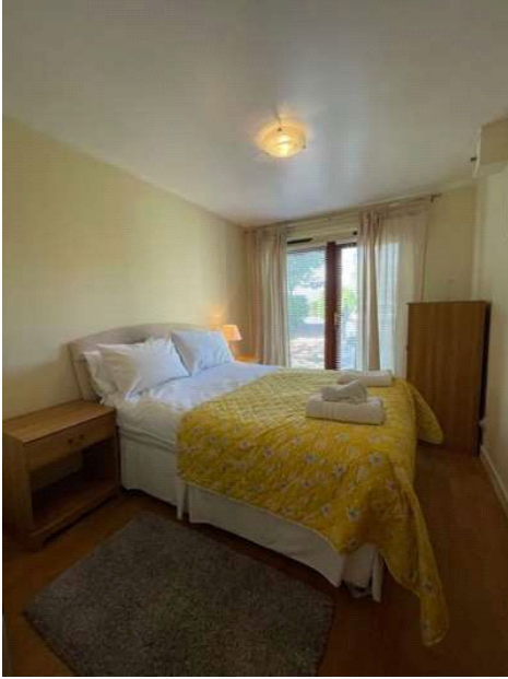
Downstairs double bedroom