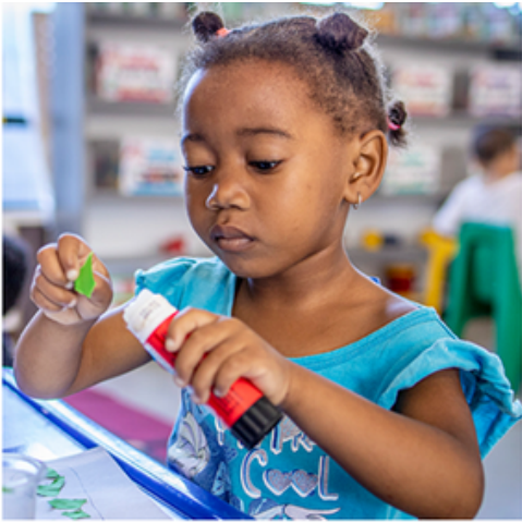
Get your children school-ready

Siyaqonda ukuthi izikhungo eziningi ze-ECD zikuthola kunzima ukutshala imali ezinkulisa zazo. Akulula ukuthola uhlelo lokufunda kusenesikhathi olugunyaziwe, olusebenziseka kalula, okokusebenza kwekhwalthi nokuqeqeshwa okusebenzayo okuzothandwa abafundi bakho nothisha futhi ongakwazi ukukukhokhela.