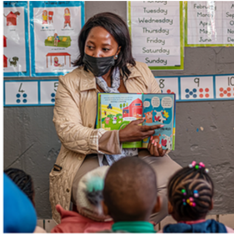
Motivate and equip teachers

Our curriculum works: teachers trust it, DSD has approved it, and children love it!