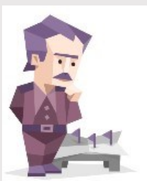
"The Architect" (INTJ-A)

www.16personalities.com/intj-personality