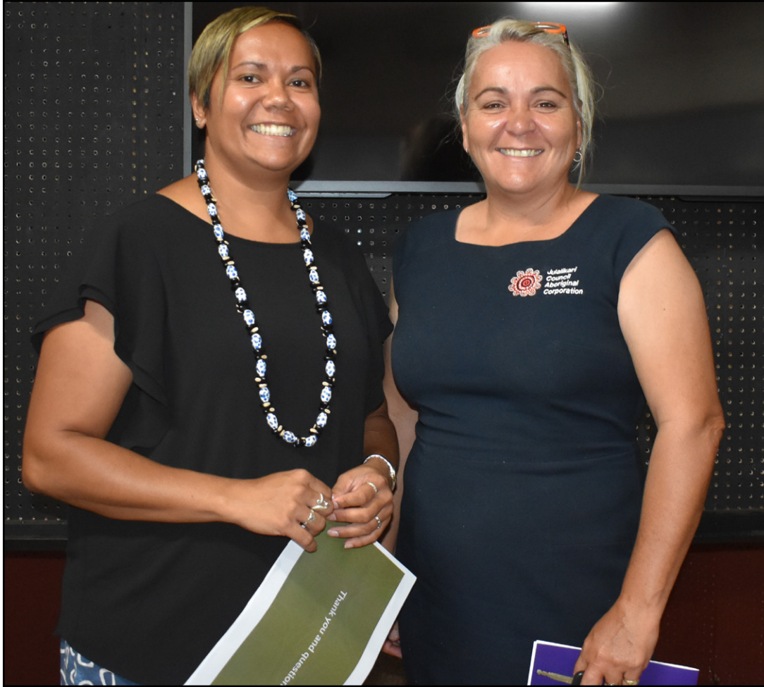
SEEKING VIEWS: Minister for Aboriginal Affairs Selena Uibo, pictured with Julalakari's Clarissa Burgen, spoke with local stakeholders about the public consultation.

MINISTER for Aboriginal Affairs Selena Uibo was in town on Monday to announce a public consultation on the future of community and town living areas.