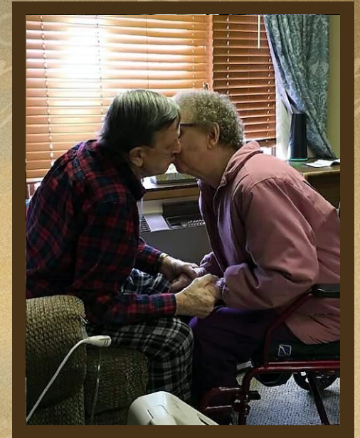
60 Years of Marriage

She was preceded in death by her parents and husband.