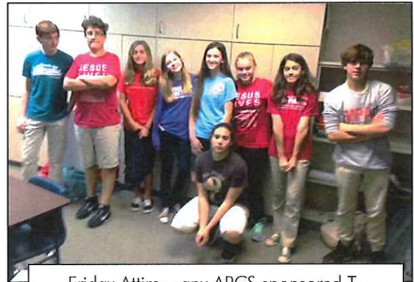
Friday Attire – any APCS sponsored T-shirt (ie: APCS spirit wear t-shirts). On Spirit Days students may wear appropriate jeans with their outfits.