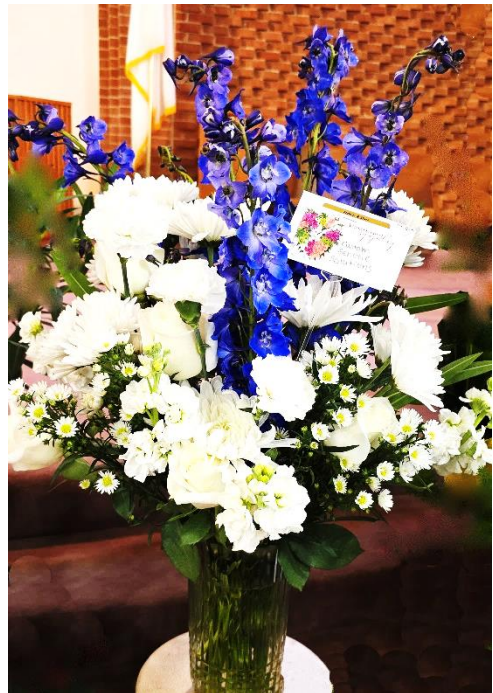
Custom Genetic Solutions