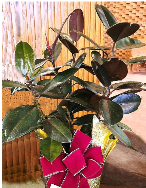
Our deepest condolences, Sweetgras Veterinary Services