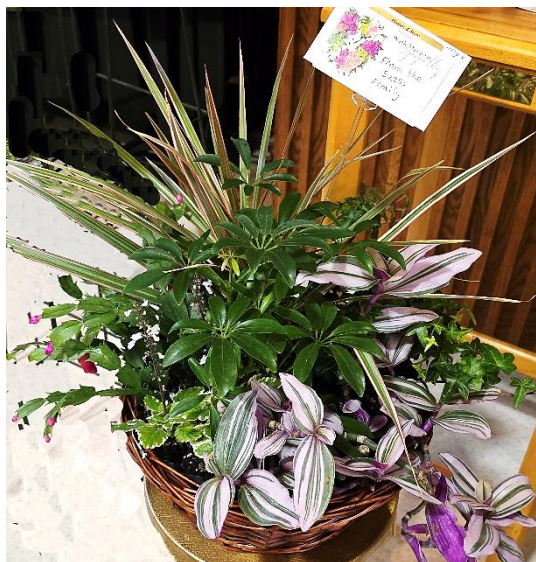
The Suess Family