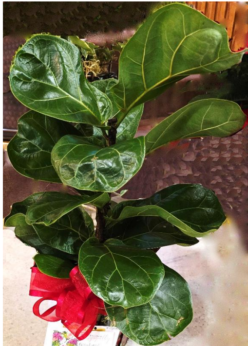
Brent and Fallon Woods