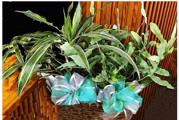
Scotland School District staff and board members