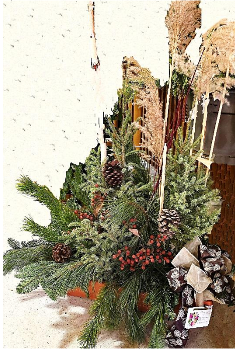
Big hugs and prayers, The Roth Family