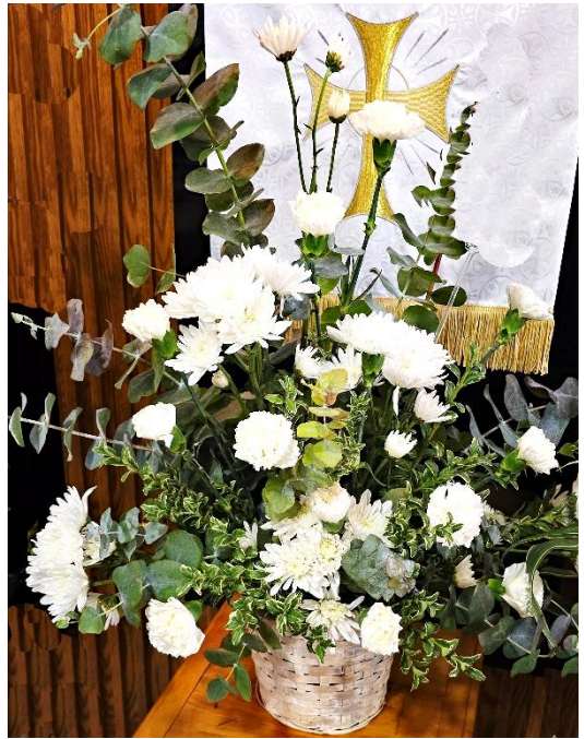
With deepest sympathies, Alan Mead