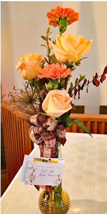
SE SD Angus Association