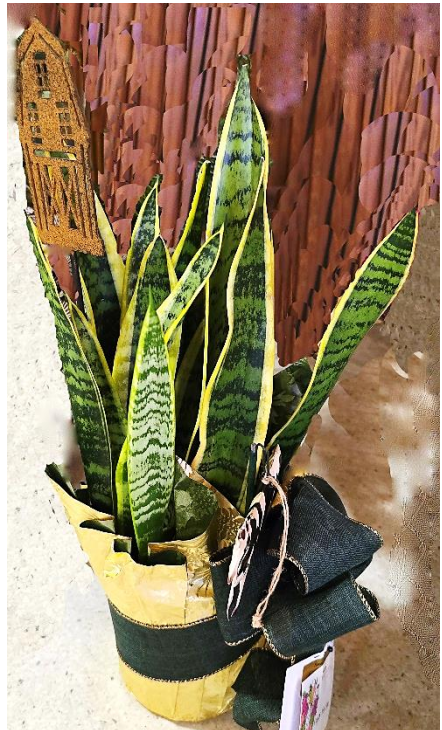
Kaylor 4-H Club