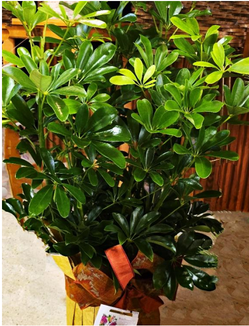
Our deepest condolences, Sweetgras Veterinary Services