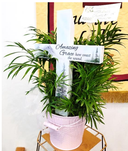
Tyndall Chamber of Commerce