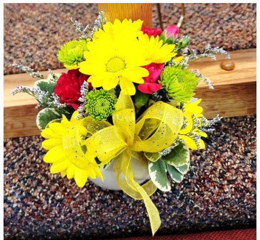
All our love! The Dorings