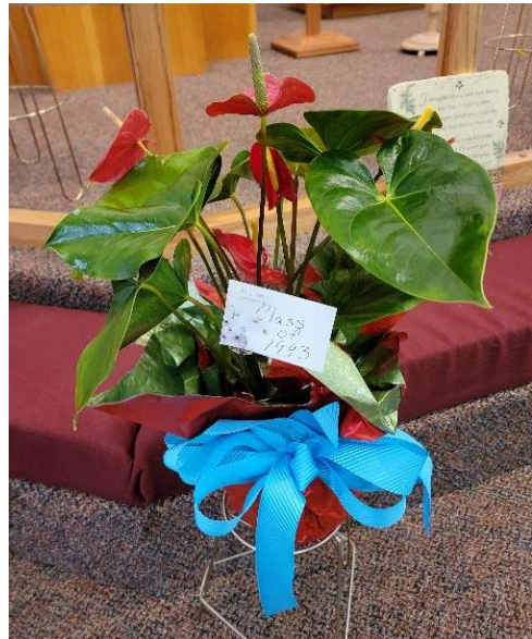
Class of 1993