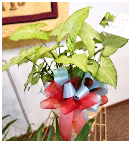
BHHS Class of 1983