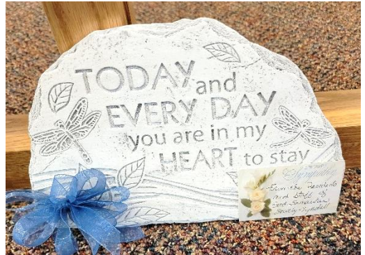
Residents & Staff of Good Samaritan Society, Tyndall