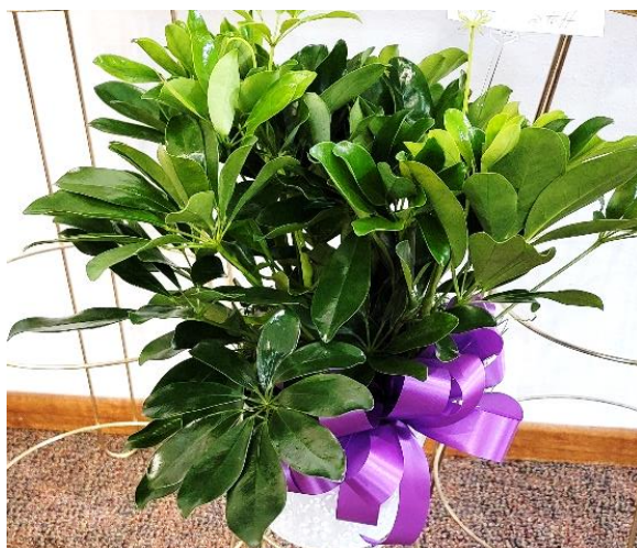
Thinking of you. Cedar 2 Staff