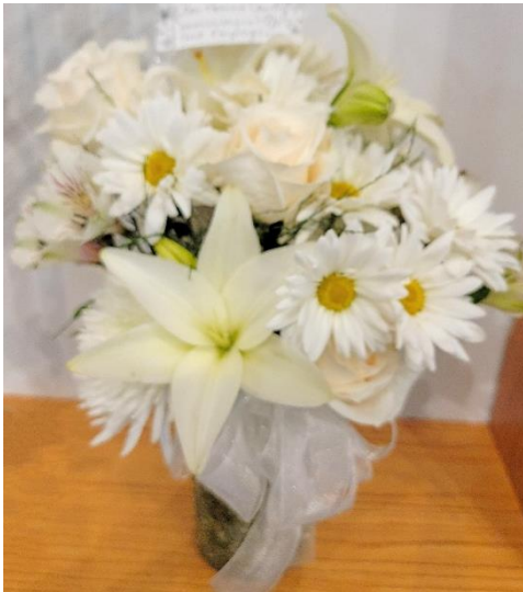
Bon Homme County Commissioners Office and Employees