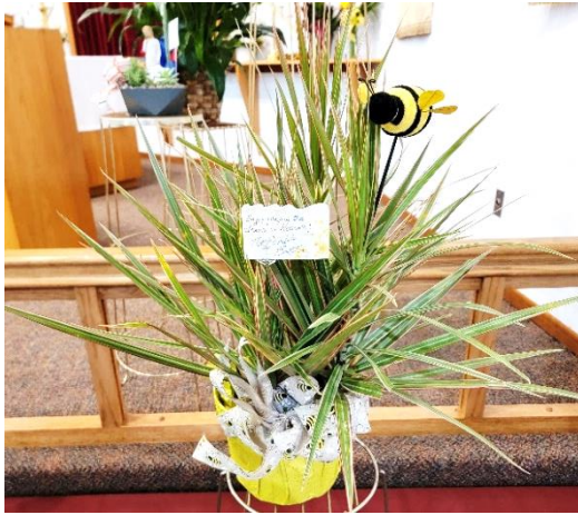
Enjoy playing the drums in heaven! The Bumble Bees