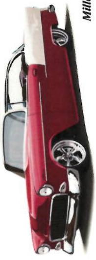
Arrangements by Miller Funeral Home ~ Fridley, Minnesota