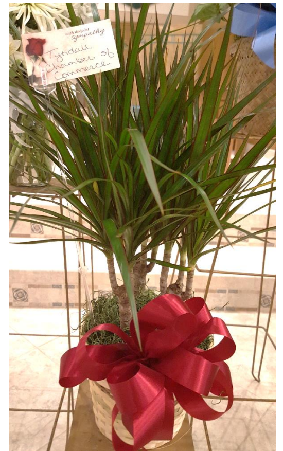
Tyndall Chamber of Commerce