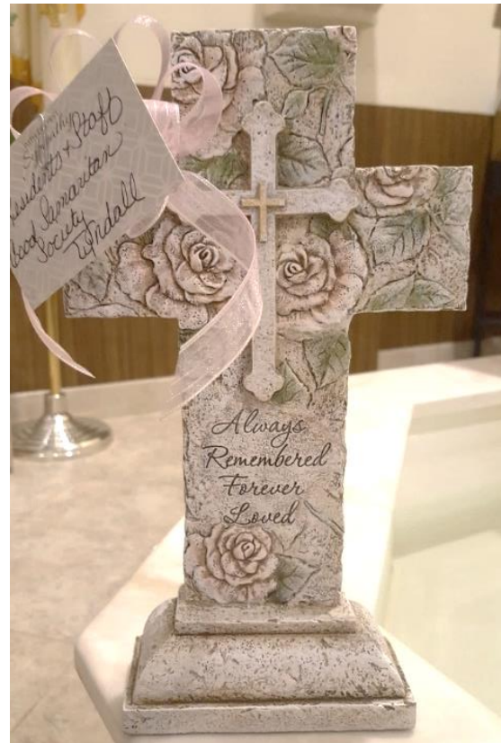
Residents & Staff Good Samaritan Society, Tyndall