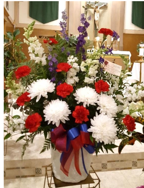
The Improved Turbine Engine Program office