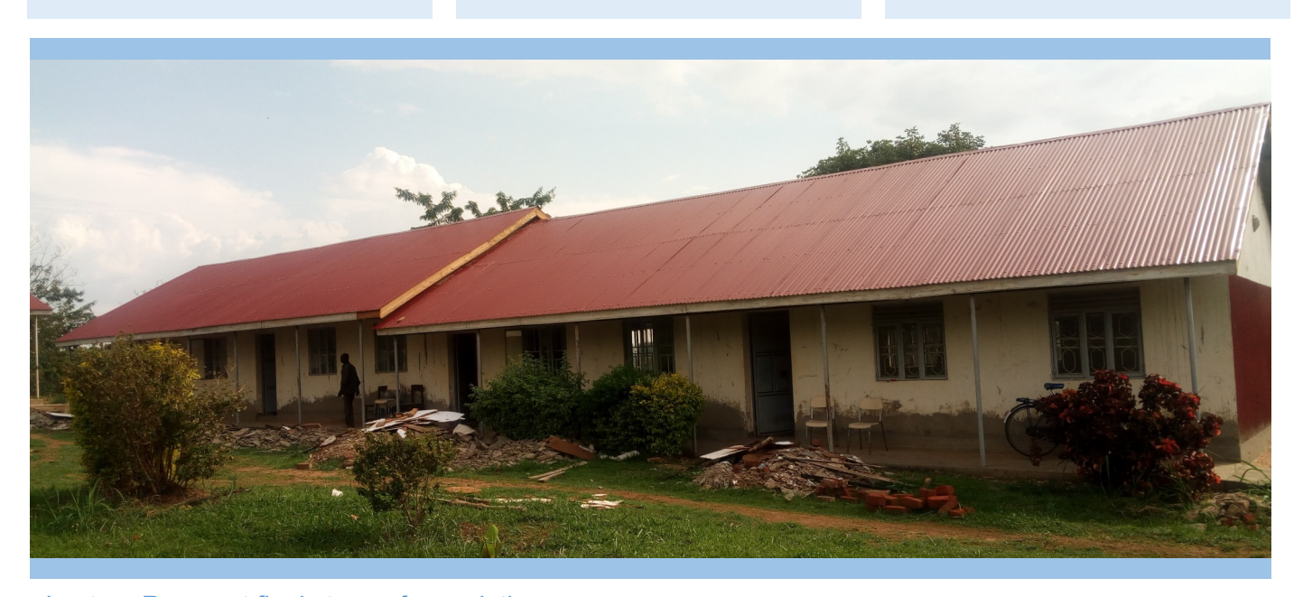
Lecture Room at final stage of completion