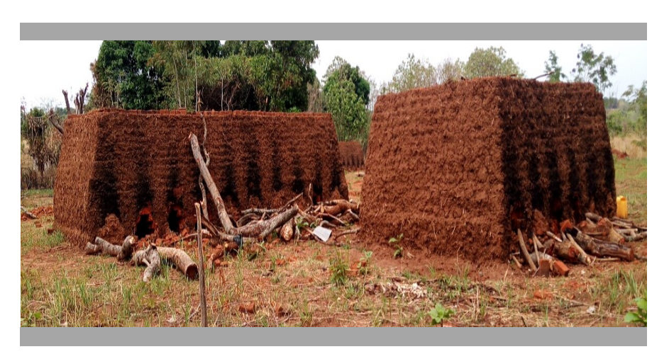
Burnt bricks for building the Chapel

The cost for the building chapel is USD 65,000.