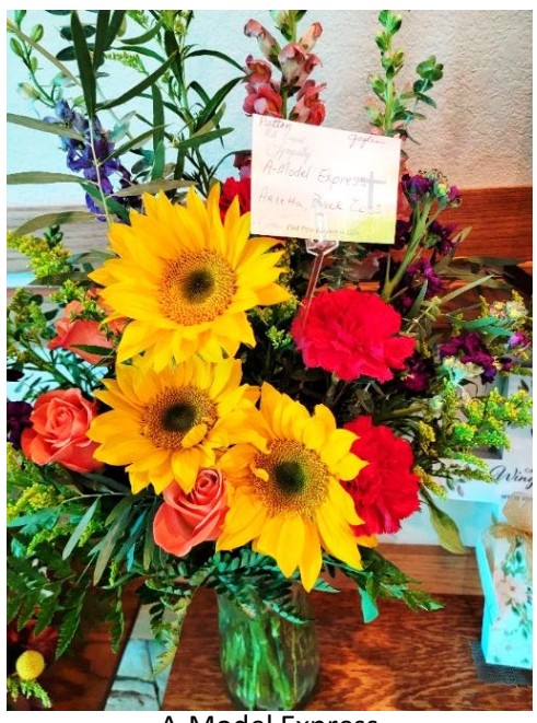
A-Model Express Arletta, Buck Zoss