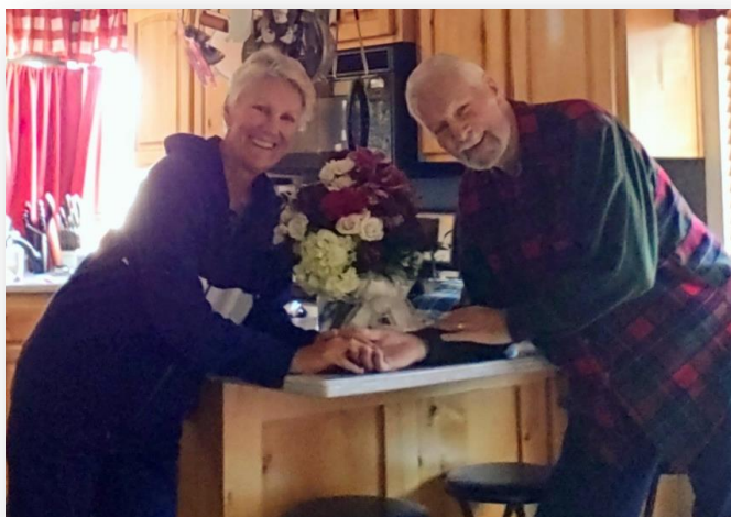
56th wedding anniversary