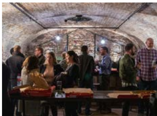
Some images from the launch of a Grow Remote Dublin Chapter