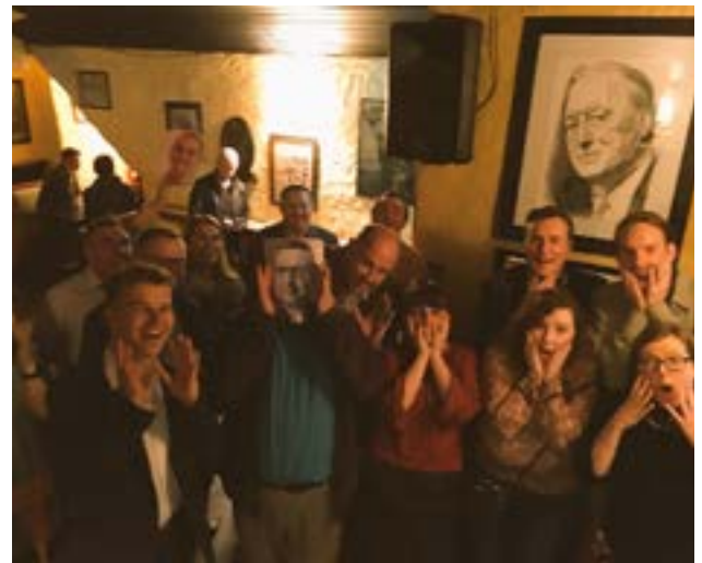
The small but growing Grow Remote Team