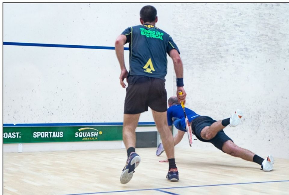
2019 Australian Masters Squash Championships