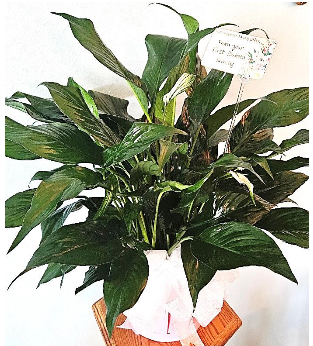
Your First Dakota Family