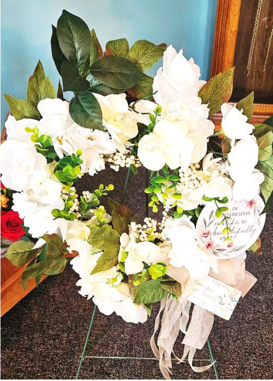
Your First Dakota Family