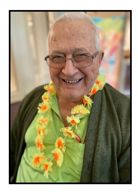
EACH LIFE IS A SONG

A life is like a song we write in our own tone and key, each life we touch reflects a note that forms the melody. We choose the theme and chorus of the song to bear our name, and each will have a special sound, no two can be the same. So when someone we love departs, in memory we find, their song plays on within the hearts of those they leave behind.