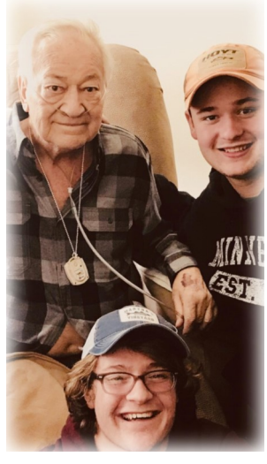
The gift of God is eternal life in Christ Jesus our Lord.